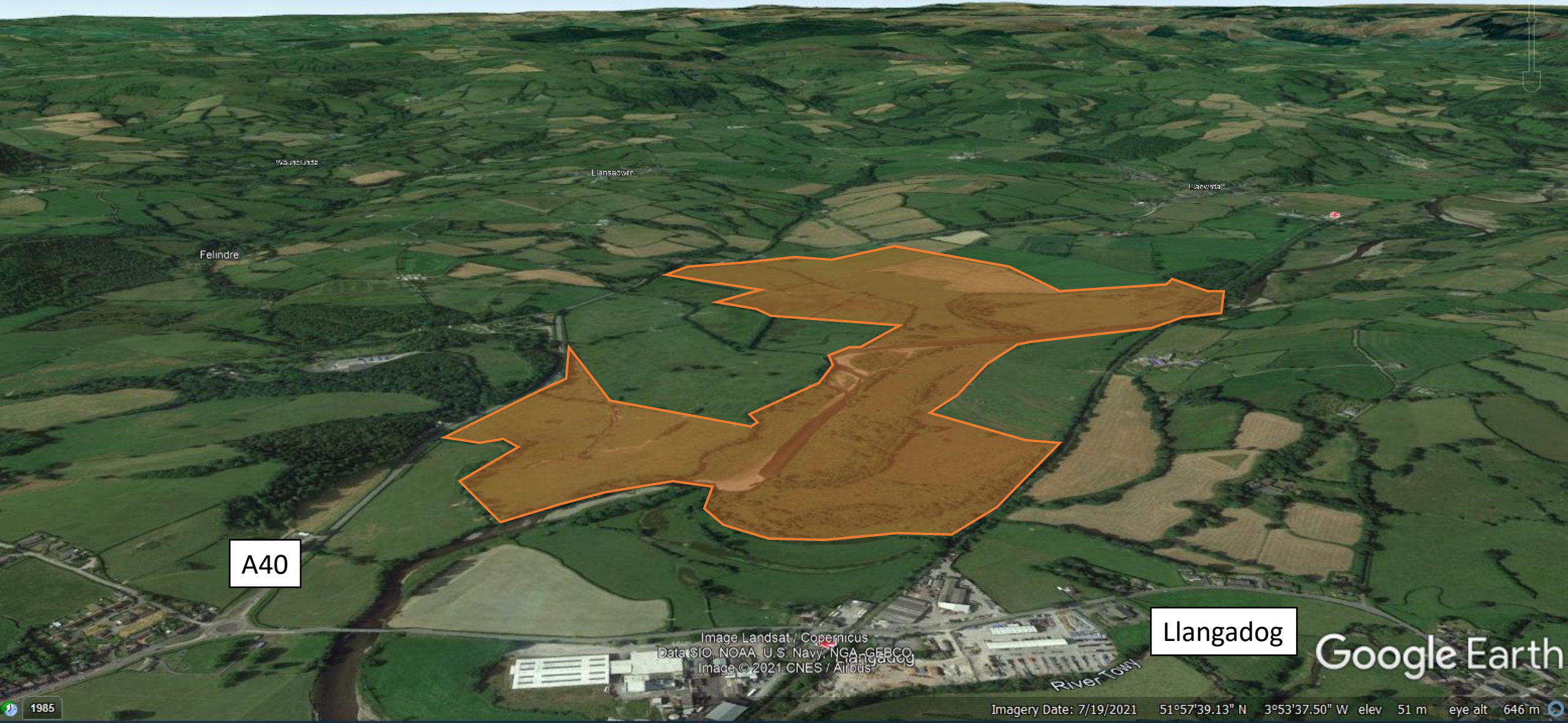
An aerial view (from satellite imagery) of the site from the direction of Llangadog