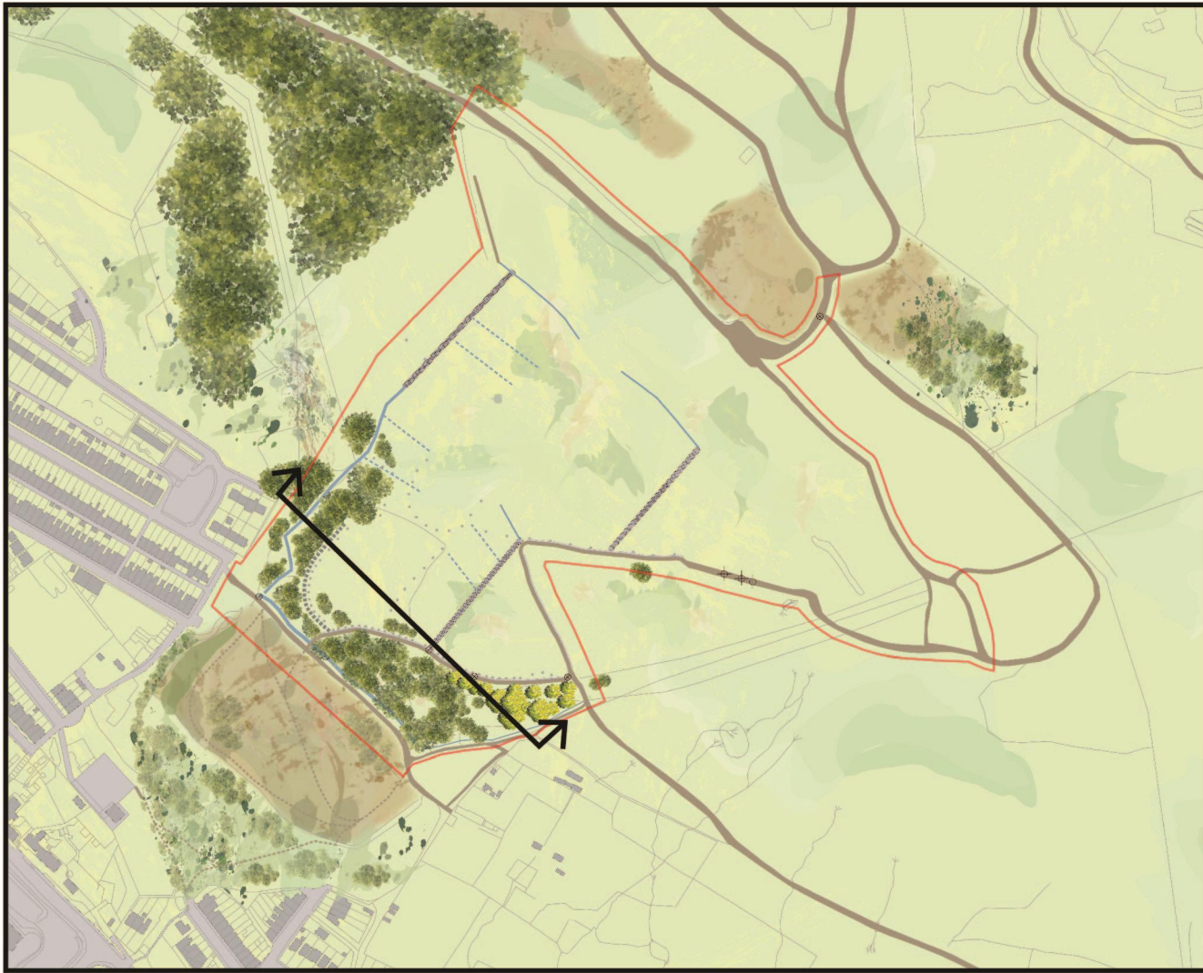
Section Location Plan - Not to scale