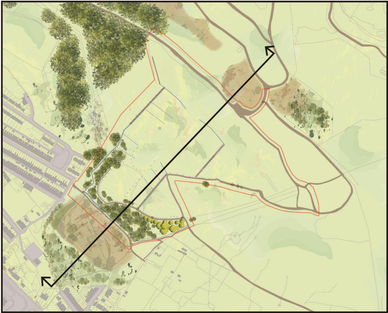
Section Location Plan - Not to scale