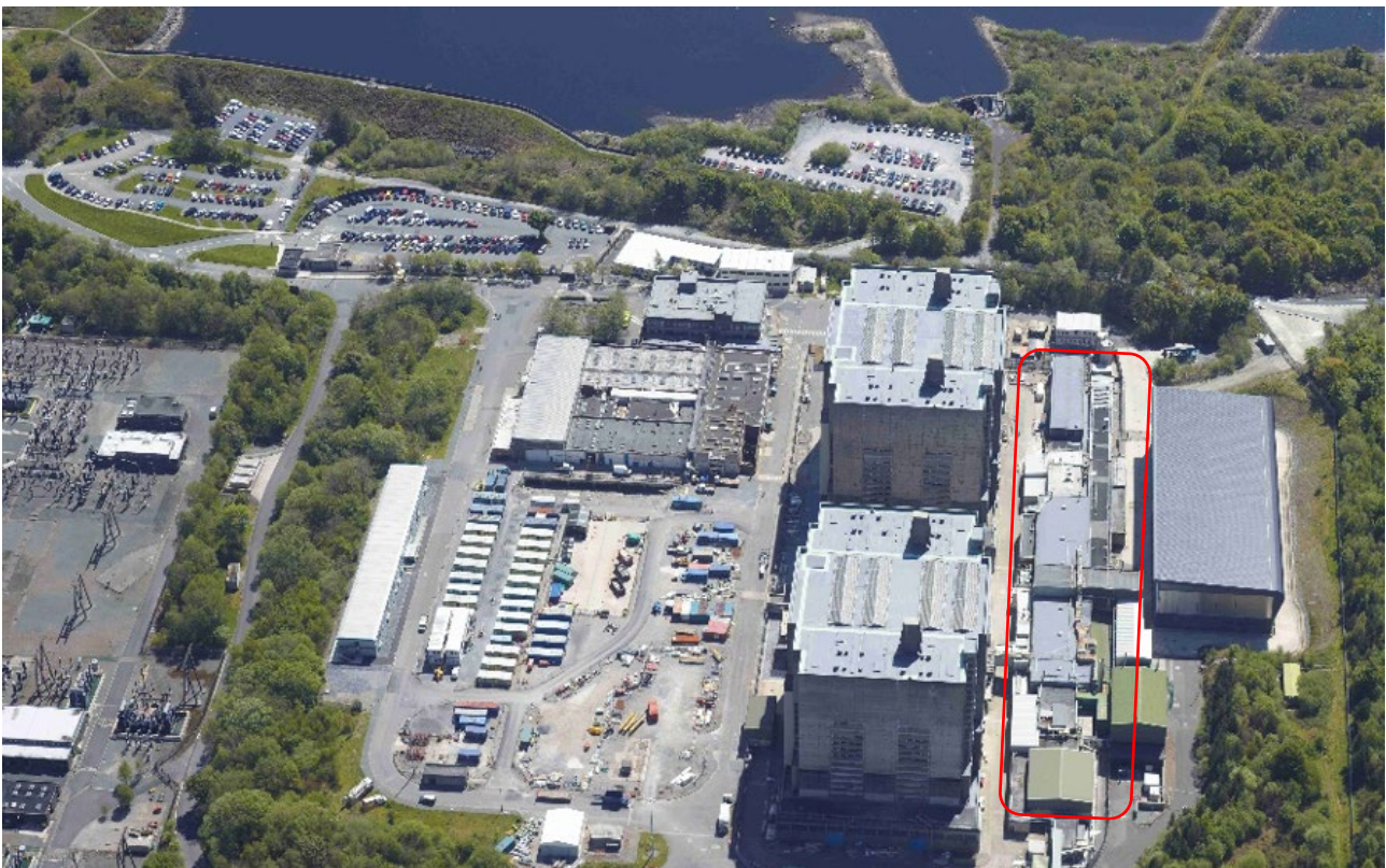
Figure 1 – Aerial view of the site showing the location of the Ponds Complex (in red)

The demolition of the Ponds Complex is just one of several major operations in the multi-decade programme of works to fully decommission the Trawsfynydd site. A summary of the currently envisaged forward programme is set out in the Site Development Plan that also accompanies this application to National Resources Wales.