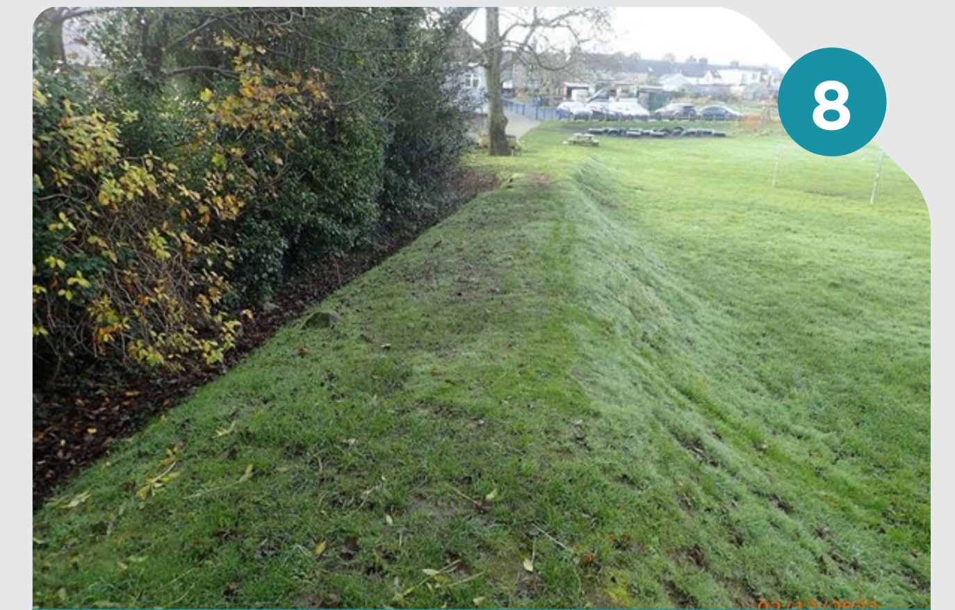
Afon Erch - Embankment