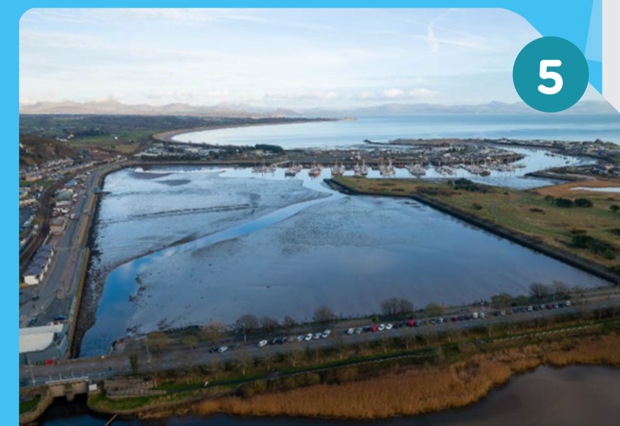
Ffordd y Cob Embankment