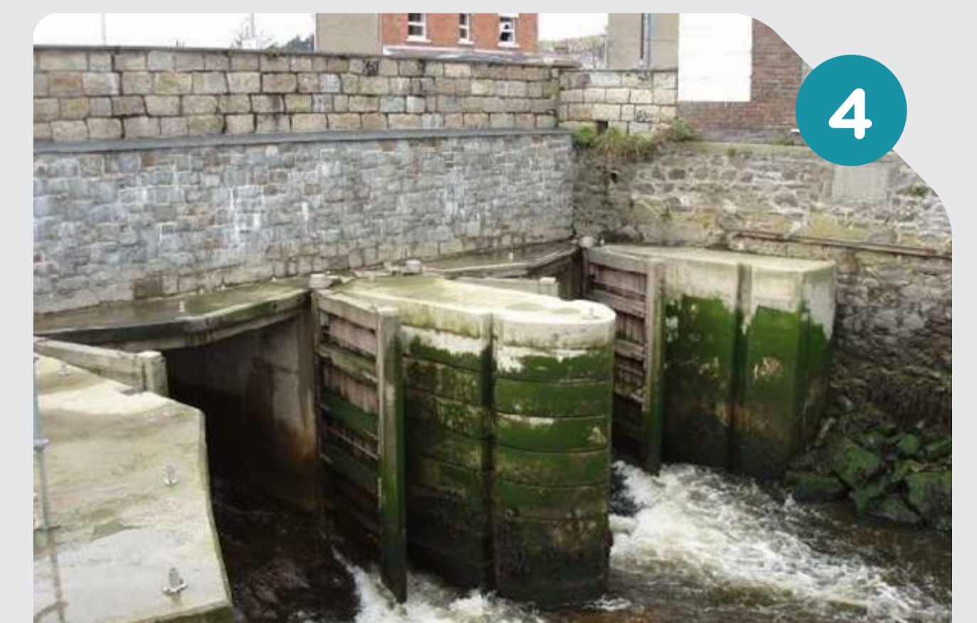
Rhyd hir Tidal Doors