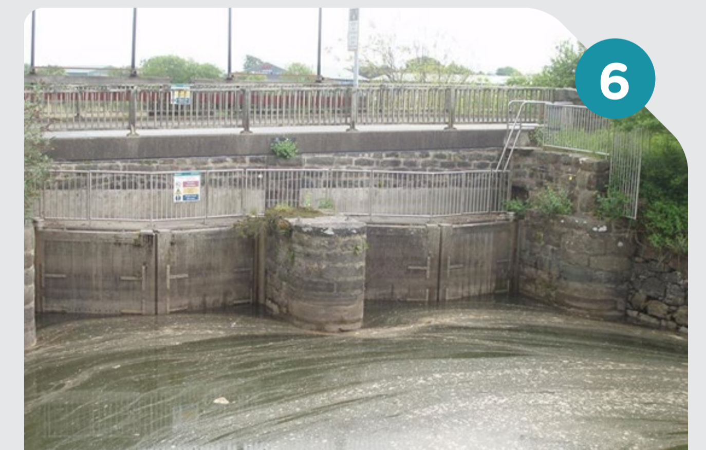
Afon Erch Tidal Doors