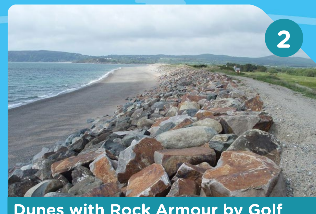
Dunes with Rock Armour by Golf Course