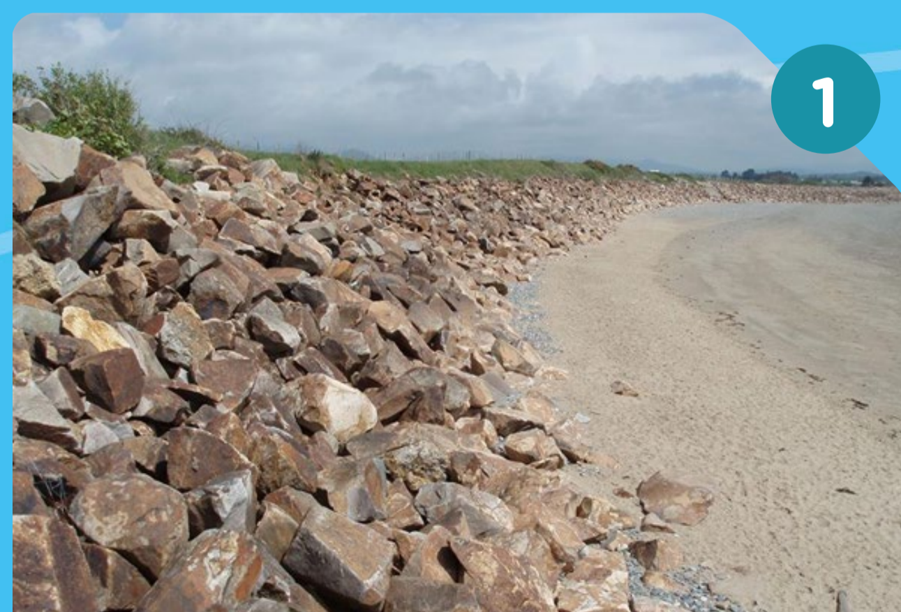
Carreg y Defaid Sea Defences