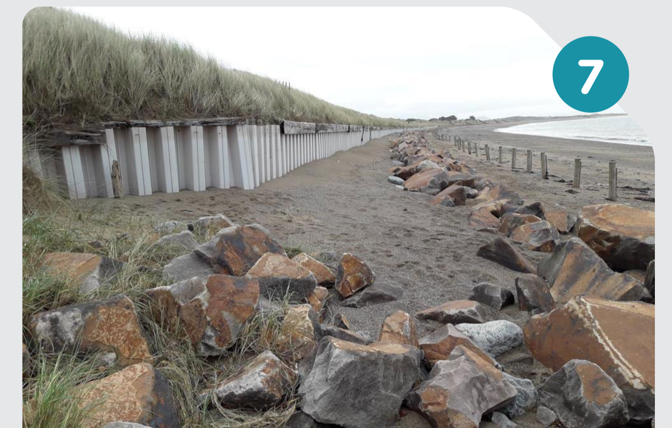
Abererch Dunes & Piles