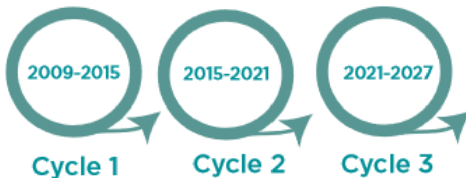
Figure 1. Schematic demonstrating the periods of time covered by each RBMP cycle.

The first WWRBMP was published in 2009 and set the framework for protecting and enhancing the water environment from 2009 to 2015. Some commitments extended to 2021 and /or 2027 and these were reviewed and updated in the second cycle RBMP, published in 2015. This third cycle again, reviews progress against the objectives and where necessary revises objectives and the associated Programme of Measures (PoM) for delivery between 2021 and 2027. An outline of the three RBMP cycles can be seen in Figure 1.