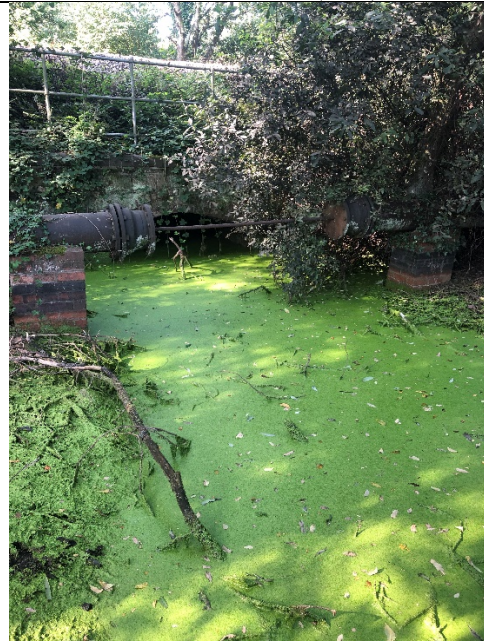
Photograph 4 showing culvert (TN6).