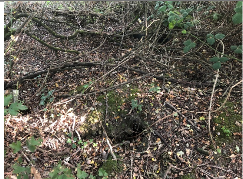
Photograph 2 showing disused badger sett with four blocked entrances (TN4).