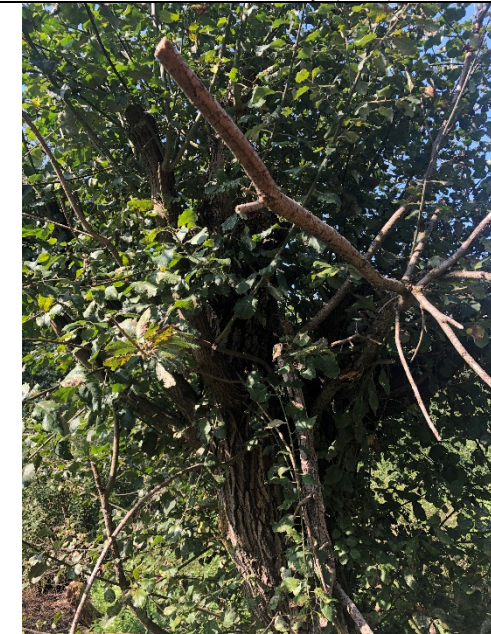
Photograph 8 showing willow tree with moderate bat roost suitability next to culvert (TN10).