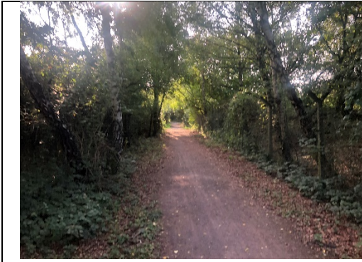
Photograph 1 showing location of scrub and treeline either side of path.