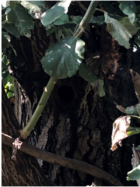
Photograph 9 showing woodpecker hole and cavity (TN10).