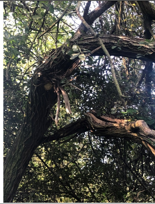
Photograph 6 showing Crack willow with moderate bat roost suitability (TN8).