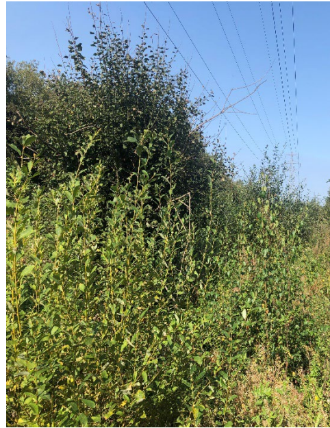
Photograph 10 showing scrub and woodland habitat.