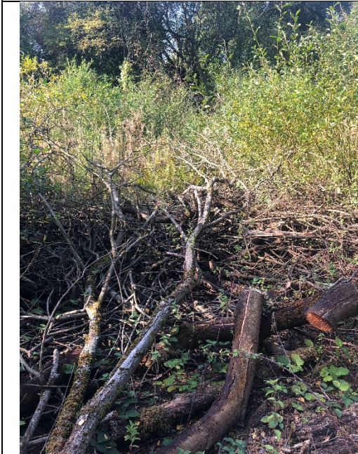
Photograph 7 showing brush piles underneath overhead power lines (TN7).