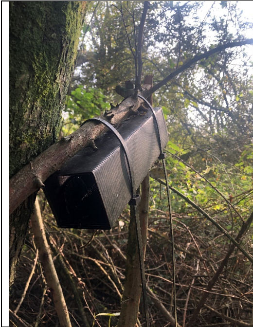
Photograph 5 showing old dormouse nest tube.