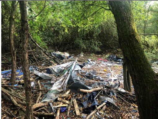
Photograph 3 showing disused camp (TN3).